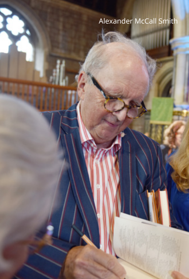
Alexander McCall Smith